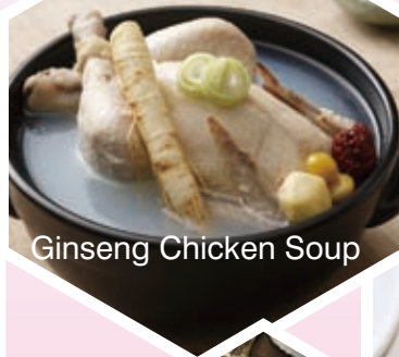
Ginseng Chicken Soup