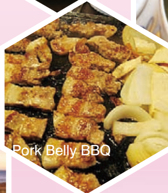
Pork Belly BBQ