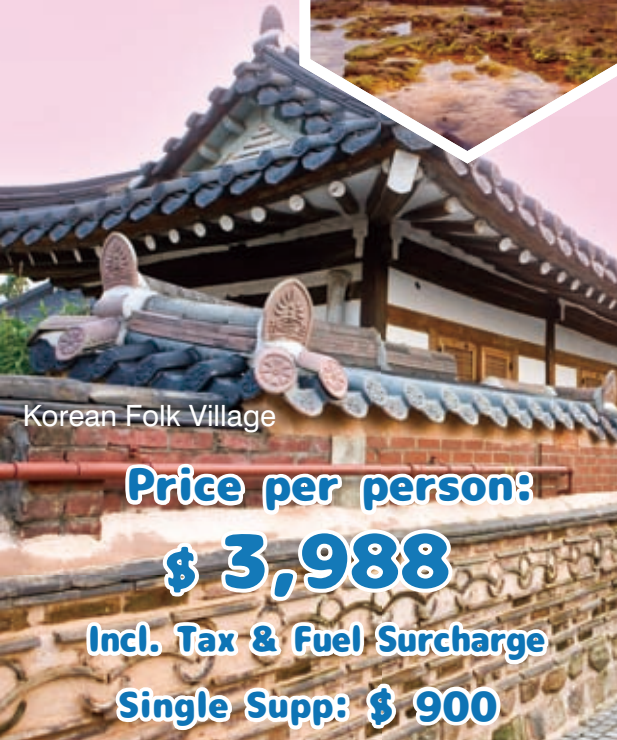
Korean Folk Village