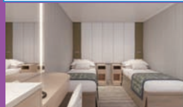
Inside Cabin From $ 3,088