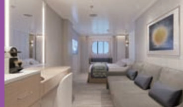
Ocean View Cabin Please Call for Detail