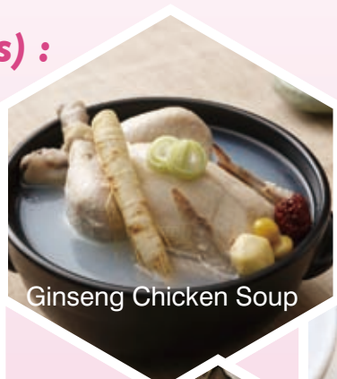
Ginseng Chicken Soup