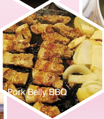
Pork Belly BBQ