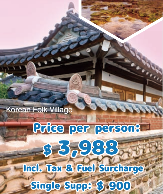
Korean Folk Village