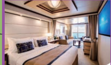
Mini-Suite Cabin Please Call for Detail