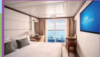
Balcony Cabin Please Call for Detail