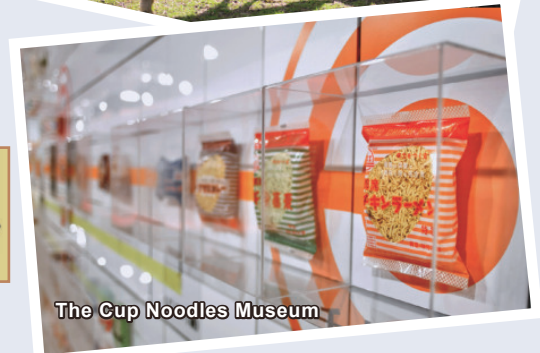
The Cup Noodles Museum