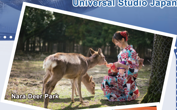
Nara Deer Park