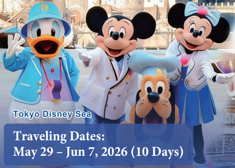
Tokyo Disney Sea

Cities Covered: Osaka, Nara, Kyoto, Hakone Yokohama, and Tokyo