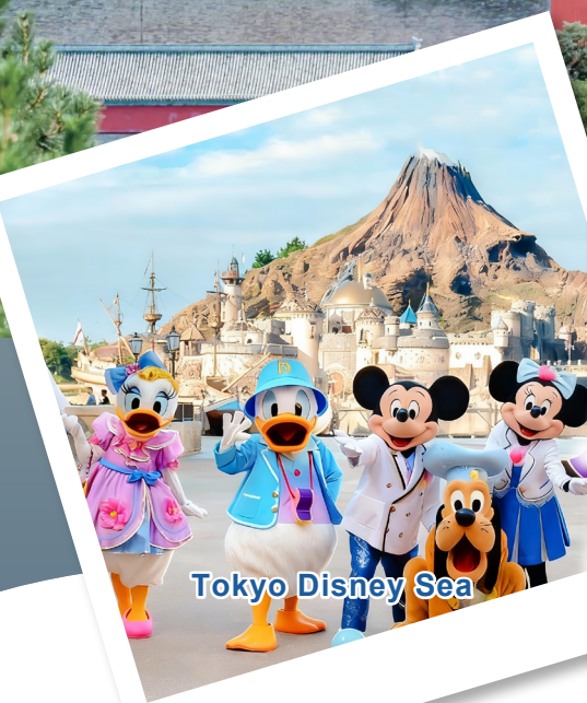
Tokyo Disney Sea