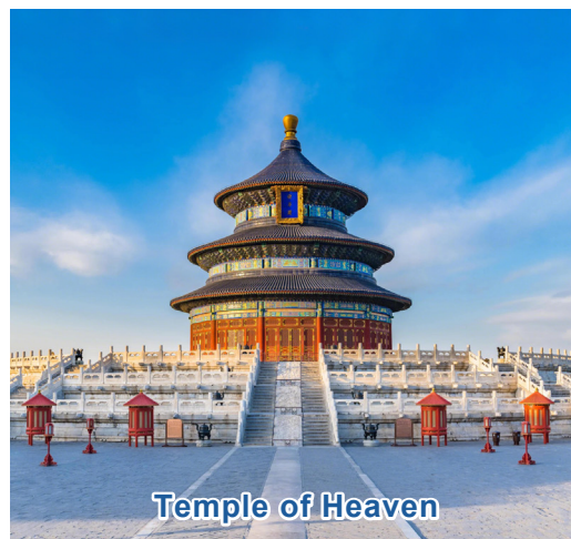
Temple of Heaven