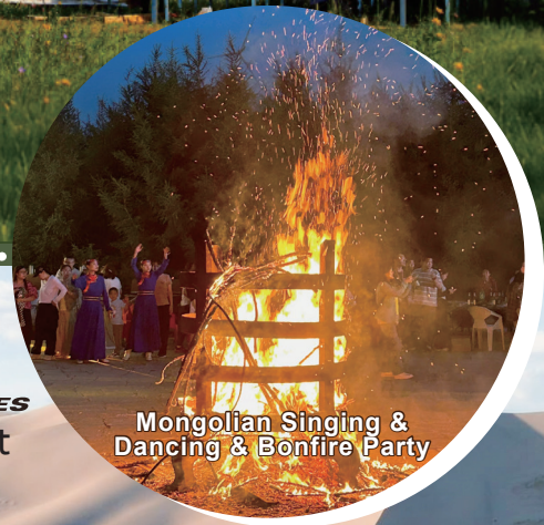
Mongolian Singing & Dancing & Bonfire Party