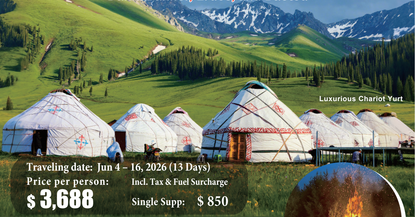
Luxurious Chariot Yurt

Cities and Sites Covered: Beijing, Hohhot, Xilamuren Dalad Banner, Erdos, and Baotou