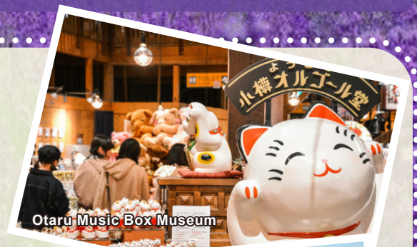
Otaru Music Box Museum