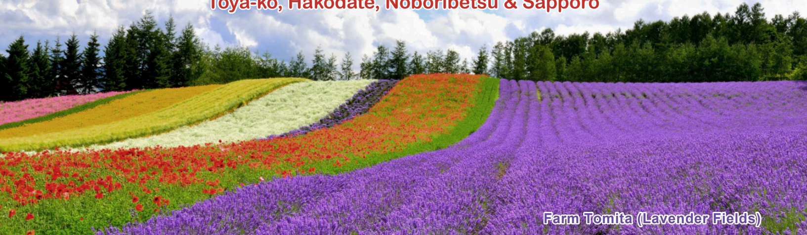
Farm Tomita (Lavender Fields)

Cities covered: Chitose, Furano, Biei, Asahikawa, Otaru Toya-ko, Hakodate, Noboribetsu & Sapporo