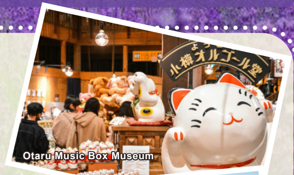
Otaru Music Box Museum