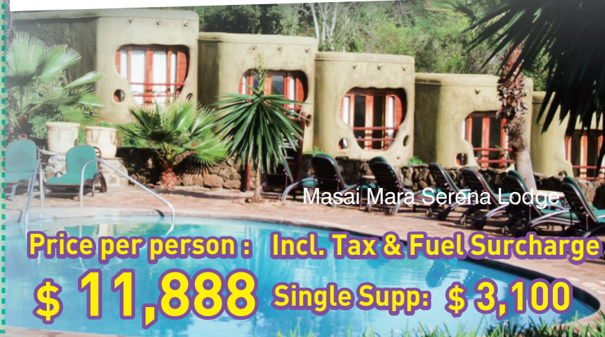
Masai Mara Serena Lodge

Price per person : Incl. Tax & Fuel Surcharge