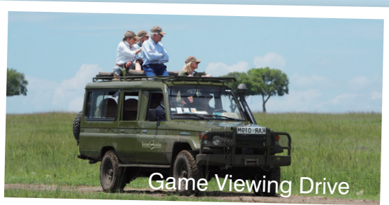
Game Viewing Drive

National Parks Covered: Lake Nakuru, Masai Mara, Serengeti & Ngorongoro