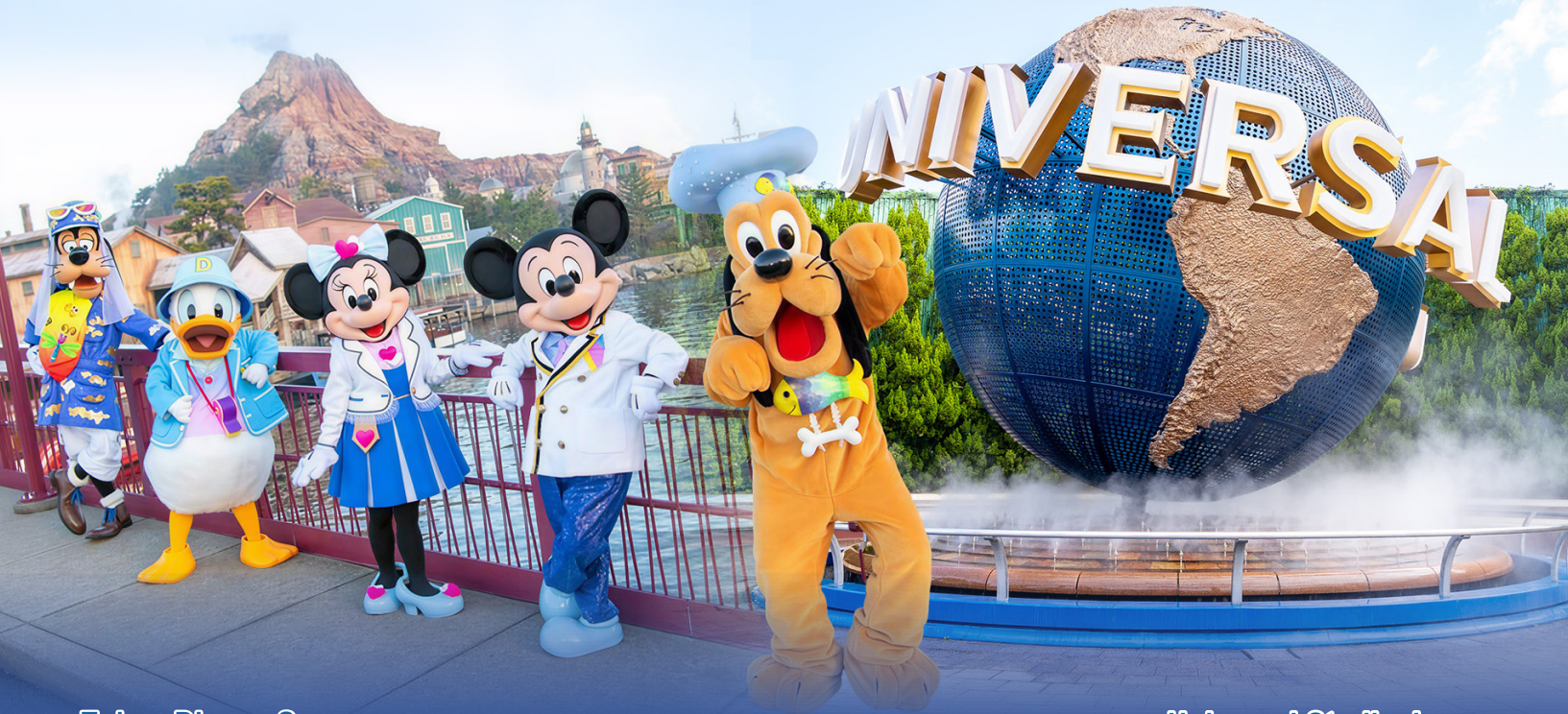
Tokyo Disney Sea

Cities Covered: Osaka, Nara, Hakone, Yokohama, and Tokyo