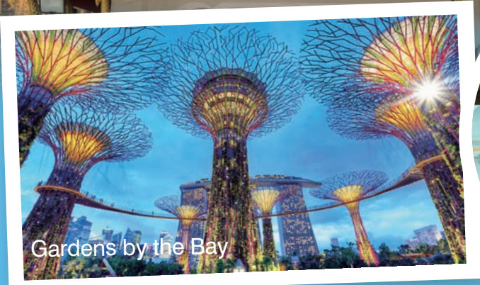
Gardens by the Bay