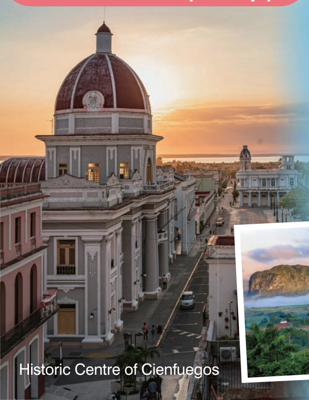
Historic Centre of Cienfuegos