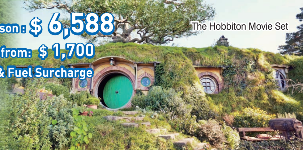
The Hobbiton Movie Set